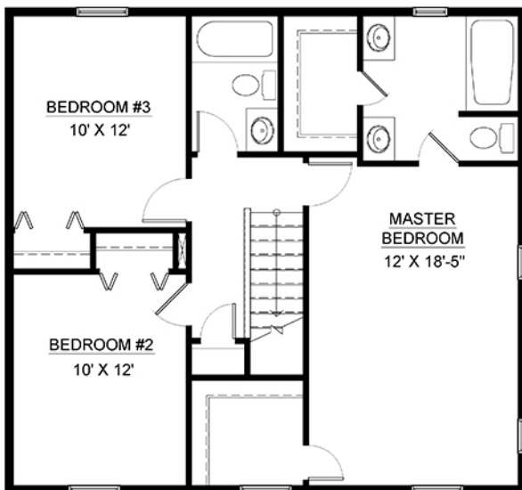
Second Floor Plan D