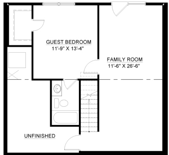
Opt. Finished Basement

All room dimensions and area calculations are approximate and subject to change. This brochure is for illustrative purposes only and not part of a legal contract.