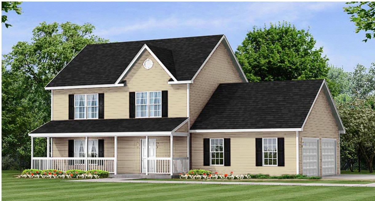
(Shown with optional garage)